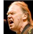
PLAY SLIDE ▶ Pictures of the Week April 5-11

ANNOUNCEMENTS: Obituaries | Births | Cards | InMemoriams | Milestones