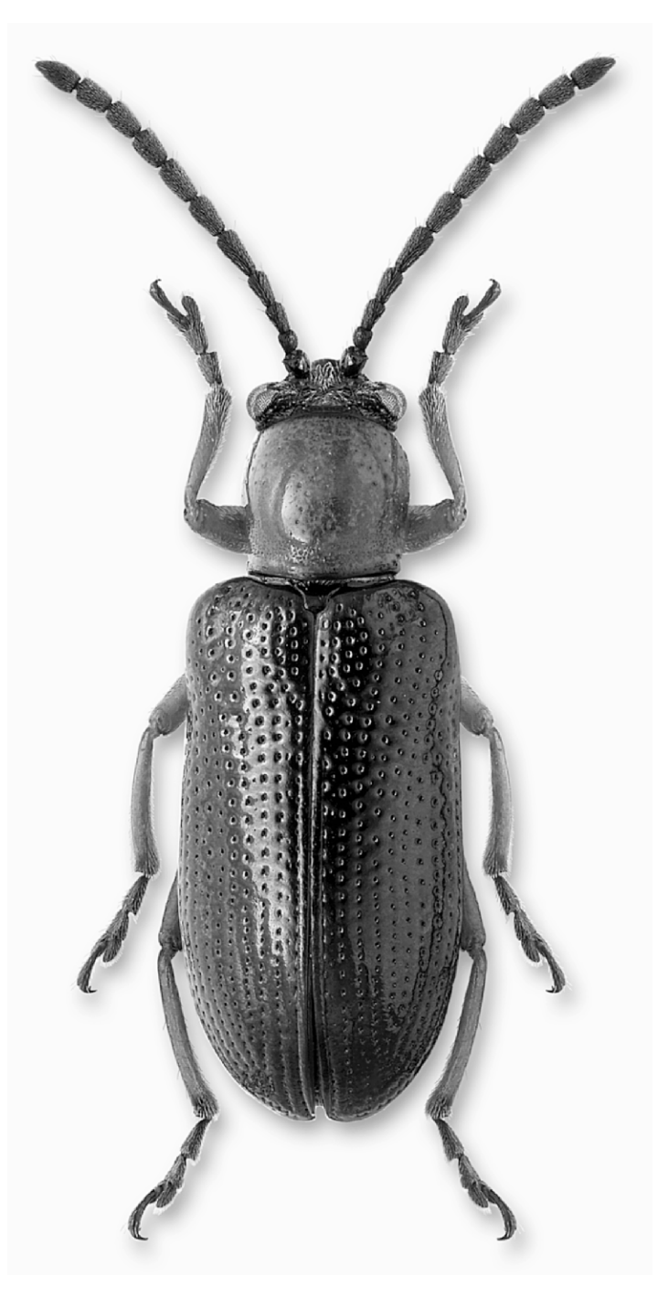
Fig. 1. Habitus photograph of Oulema melanopus.

benacadie, 31.VII, 1997, J. Ogden, (1, JOC); Shubenacadie, 1.VIII, 1997, J. Ogden, (2, NSNR). Halifax Co. : Point Pleasant Park, 15.VI. 2001. C.G. Majka,