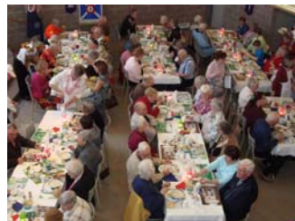
They come from all over for the ... mm mm good chowder!