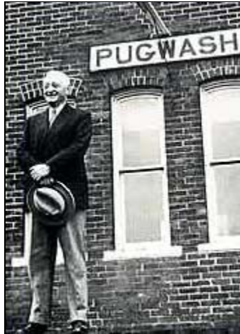
Cyrus Eaton in front of the Pugwash station